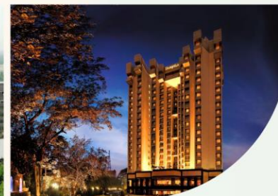
Shangri-La's Eros Hotel