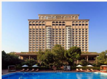
Taj Mahal Hotel